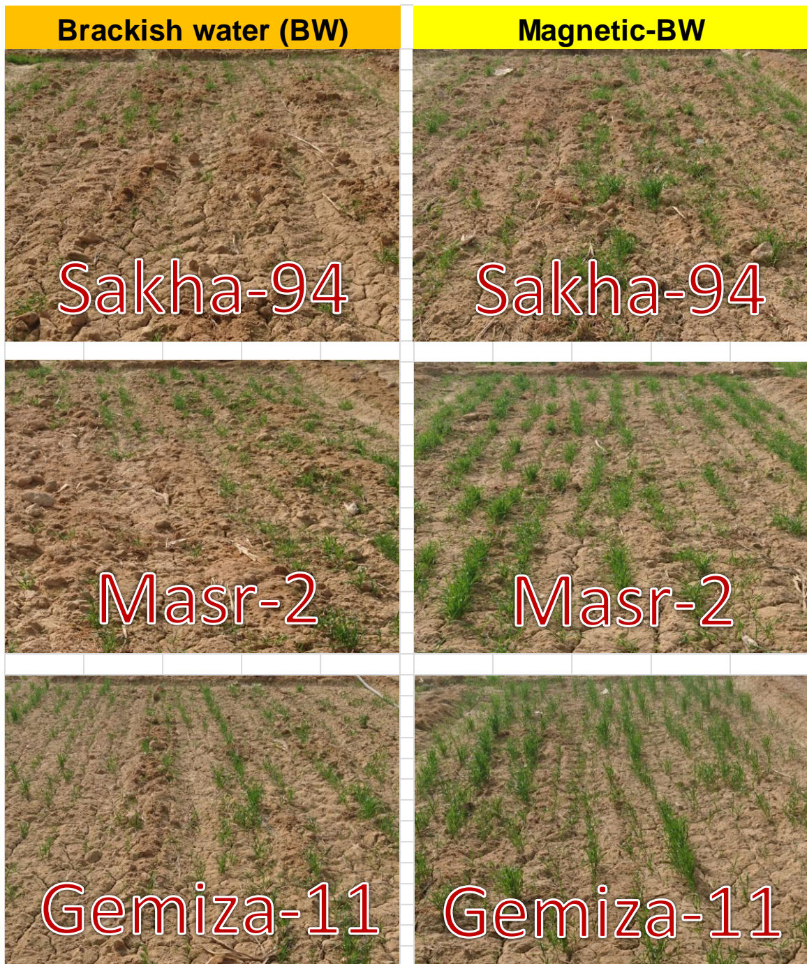
Fig. 2. The three wheat varieties were irrigated with brackish water (BW) and magnetic-brackish water (M-BW) at initial vegetative stage