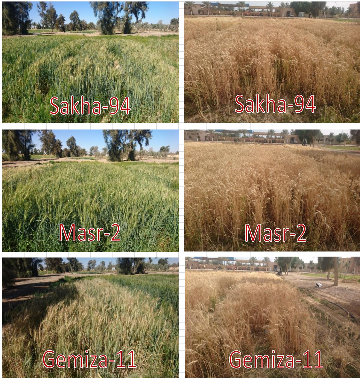
Fig. 3. The three wheat varieties were irrigated with magnetic-brackish water (M-BW) at maturity and harvest stage

respectively. Significant differences were recorded in wheat yield and its components at harvest due to the interaction between varieties and irrigation water treatments (Tables 6 and 7). Sowing Gemiza-11 and irrigation with M-BW 1 or M-BW 2 gave the highest value of all recorded yield parameters, followed by Maser-2 and Sakha-94, respectively, while sowing the three wheat varieties and irrigation with brackish water (BW) gave the lowest values in yield and yield components parameters.