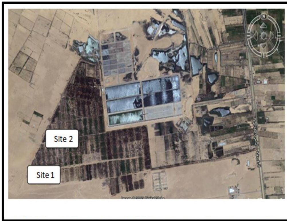
Fig. 1. Location of Serapium plantation and experimental sites

Azadirachta indica form factor is: 0.38( Nanang et al. , 1997).